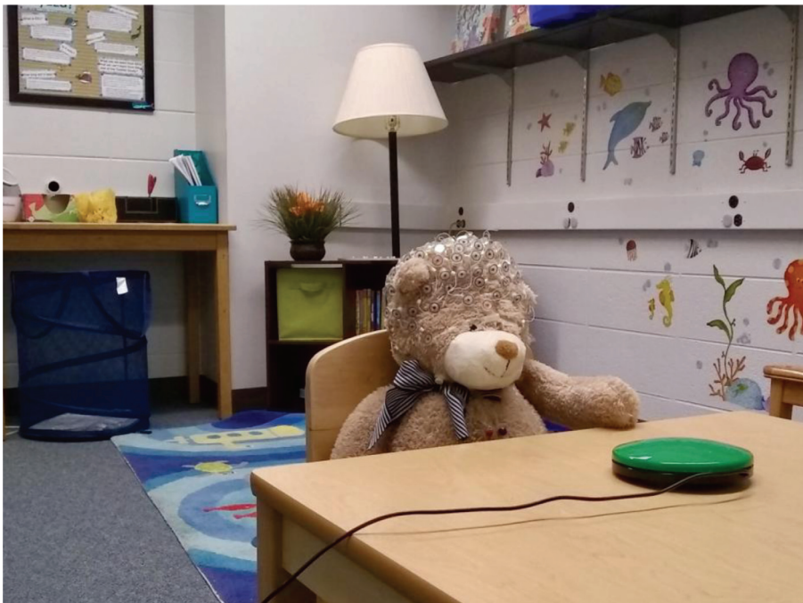
Figure 1. Example of child-friendly setup for EEG collection room.

experiment as a whole. Increased risk is of particular concern in work with young children, who receive special protections in human subjects research. One possible alternative to scalp abrasion procedures that are already becoming less common is to comb the scalp, although the generalizability of the effectiveness of this technique may be limited, as it was tested with older children who were primarily male (Mahajan & McArthur, 2010). As a result, most investigators who work with young children will want to employ EEG systems that can tolerate higher levels of input impedance. While high-impedance systems are commonplace in work with young children, a compromise is associated with their use. Specifically, higher impedances decrease common-mode rejection sensitivity, which minimizes artifacts that occur simultaneously across sites in the EEG recording. That is, higher impedance levels impair the ability to estimate noise that is common across all electrodes so that it can be (mathematically) removed from the data. This means that, in the final data, a greater proportion of the signal may be task-irrelevant noise rather than isolated task-related activity.